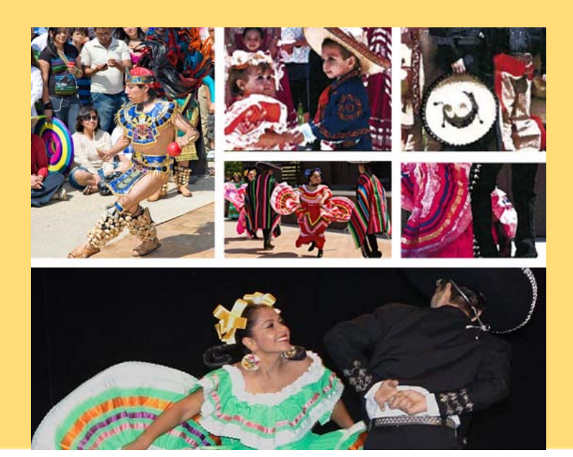
Education through dance. Enrichment through culture. www.marumontero.com

Since 1992, our Festival has been celebrating, supporting, and building a broader understanding for Latin American culture and artists in the Washington, DC area and throughout the nation. Join us for our 22<sup>nd</sup> anniversary and help us continue the legacy supported by past sponsors like the Freddie Mac Foundation, Target, McDonalds, the DC Commission on the Arts, Univision, and Telemundo.